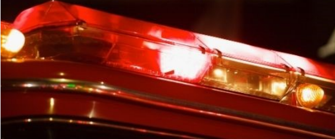
Primary EMS Responses September 12-18, 2024