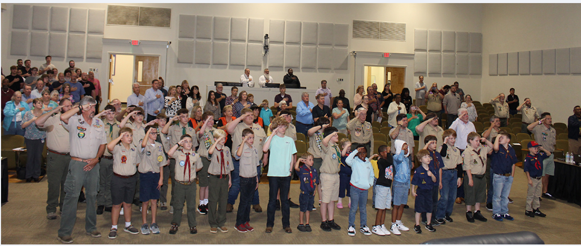
Boy Scout troops 300 and 372 and Pack 374 led the Pledge of Allegiance at the Pittsylvania County Board of Supervisors business meeting on Tuesday, September 17.