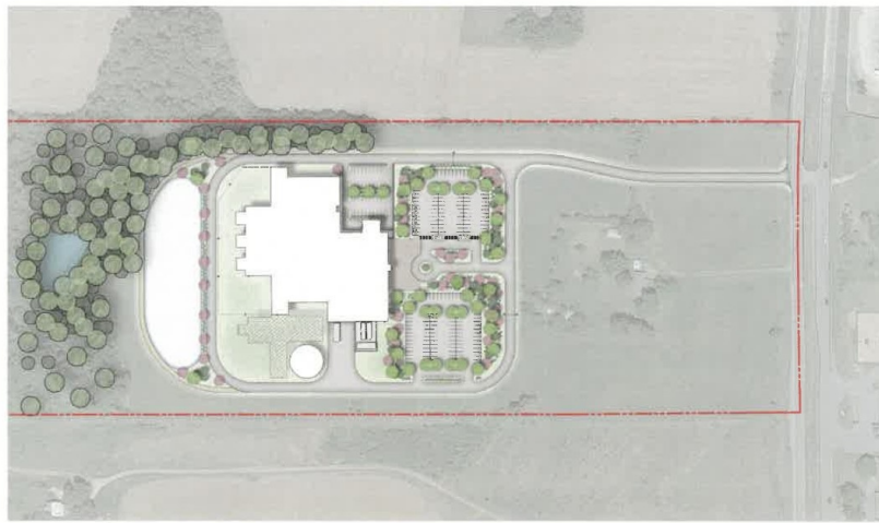
CONCEPTUAL RENDERING Pittsylvania Jail - August 23, 2023